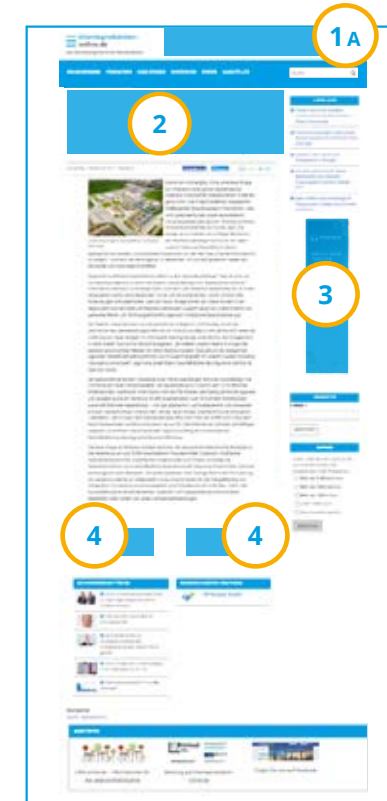
Article page desktop