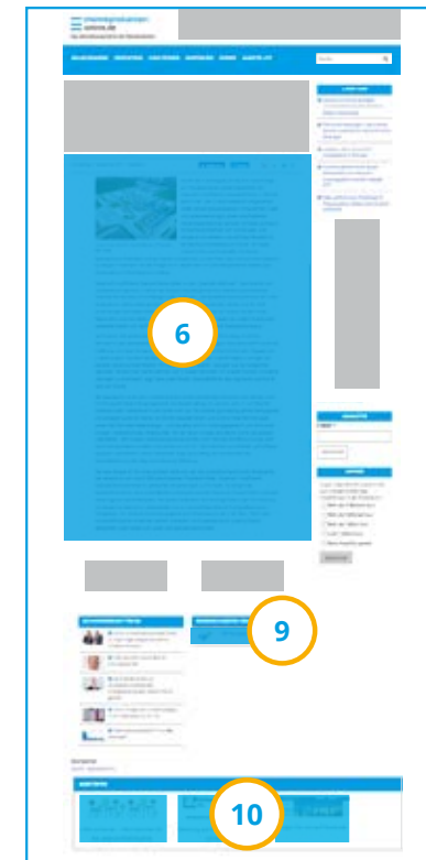
Article page desktop