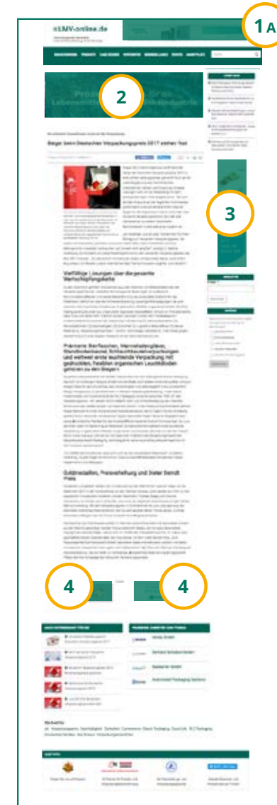
Article page desktop